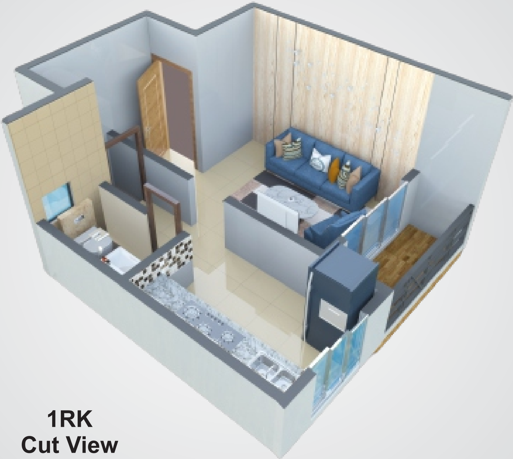
1RK Cut View