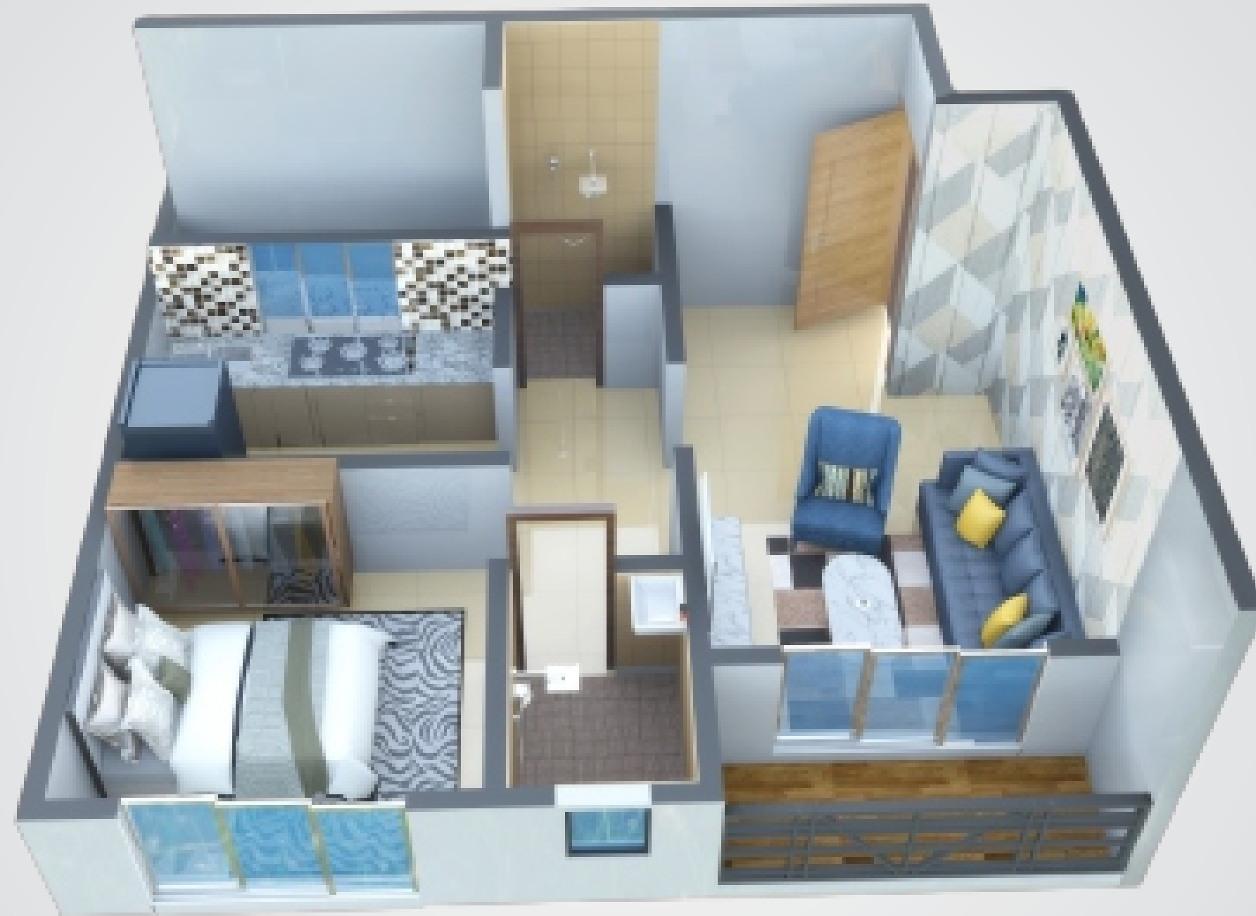
1RK Cut View