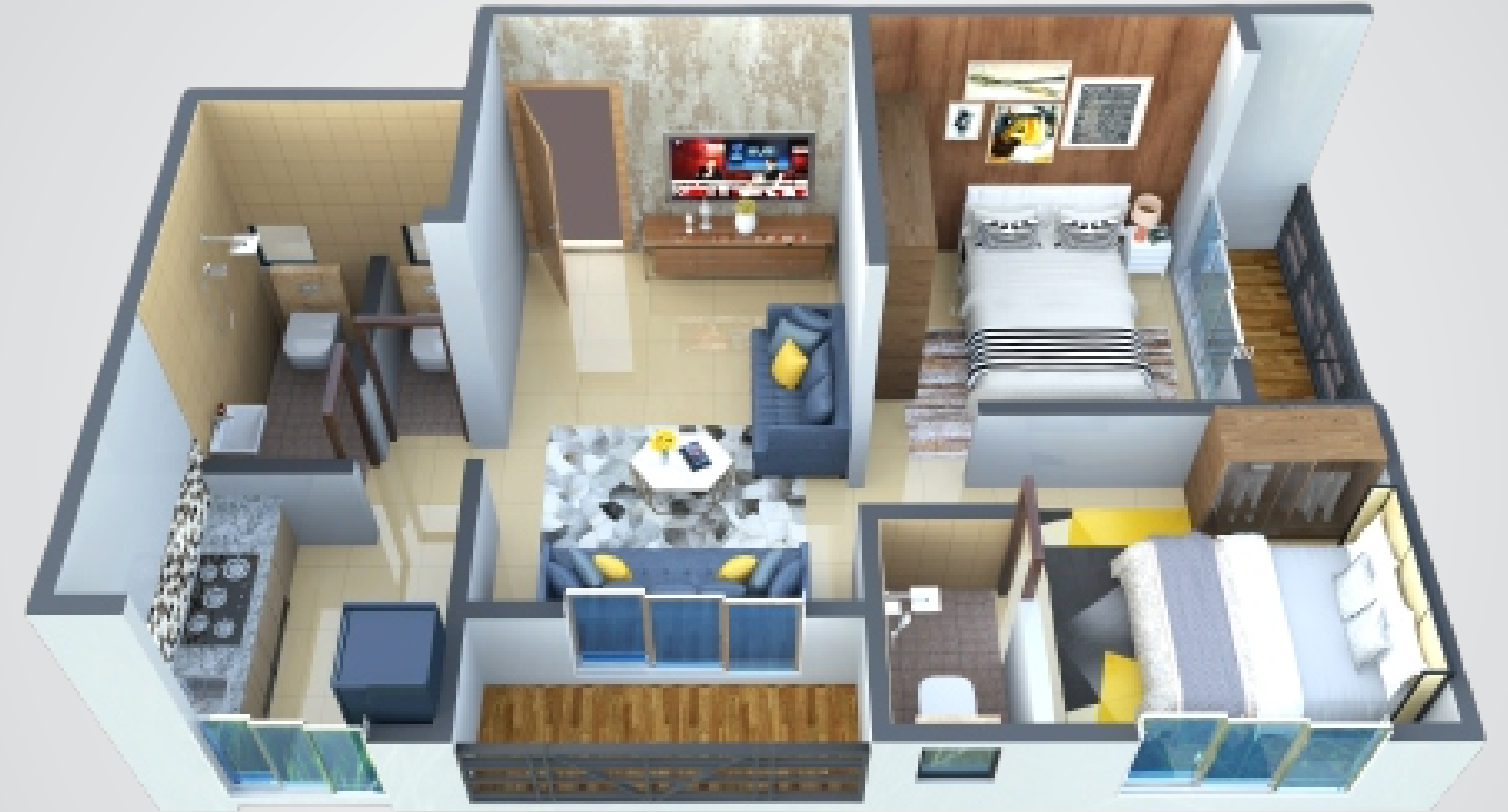
1BHK Cut View